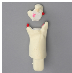
1412-3 Talus/fibula/tibia, advanced