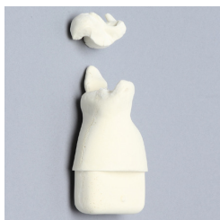
1412-1 Talus/fibula/tibia, standard