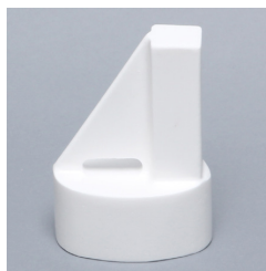
1116-23 Tibia/fibula vice block