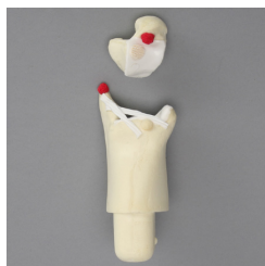
1412-2 Talus/fibula/tibia, advanced